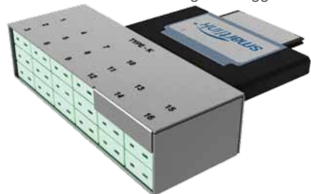
16 Channel Thermocouple Adapter