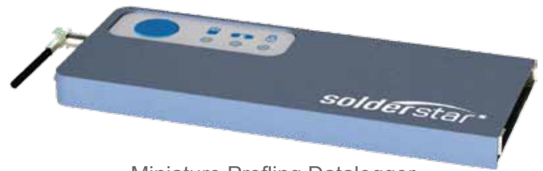
Miniature Profiling Datalogger

I-TRONIK S.R.L. - Macchine e prodotti per l'industria elettronica Via dell'Artigianato, 20 - 35010 - Peraga di Vigonza (PD) Tel. +39.049.895.2300 - Fax +39.049.893.4822 - P.IVA 01443020282 commerciale@itronik.it _ www.itronik.it