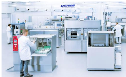
Machine Test Center