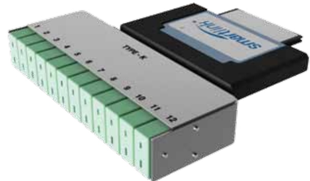
12 Channel Thermocouple Adapter