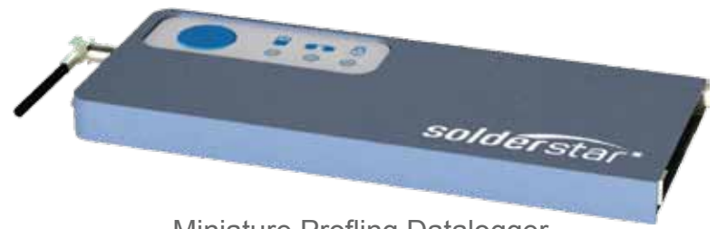
Miniature Profiling Datalogger

I-TRONIK S.R.L. - Macchine e prodotti per l'industria elettronica Via dell'Artigianato, 20 - 35010 - Peraga di Vigonza (PD) Tel. +39.049.895.2300 - Fax +39.049.893.4822 - P.IVA 01443020282 commerciale@itronik.it - www.itronik.it