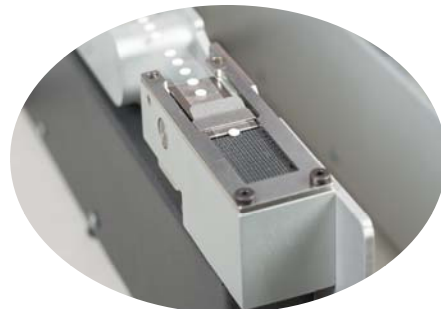
Apply of a round sensor, 3 mm diameter