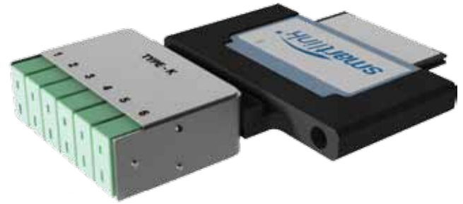
6 Channel Thermocouple Adapter