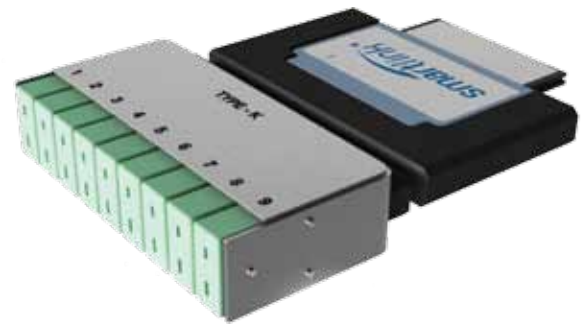
9 Channel Thermocouple Adapter

I-TRONIK S.R.L. - Macchine e prodotti per l'industria elettronica Via dell'Artigianato, 20 - 35010 - Peraga di Vigonza (PD) Tel. +39.049.895.2300 - Fax +39.049.893.4822 - P.IVA 01443020282 commerciale@itronik.it - www.itronik.it